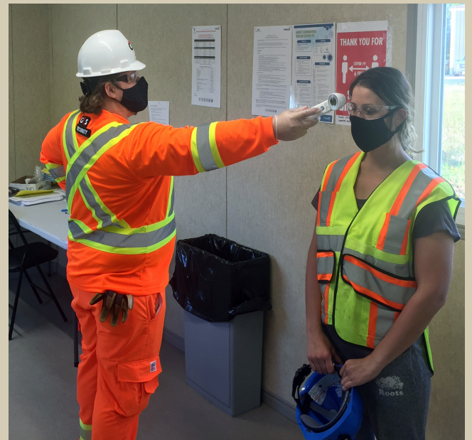
The COVID-19 screening unit, and staff in the screening process, currently in place at the Côté Gold Project site.