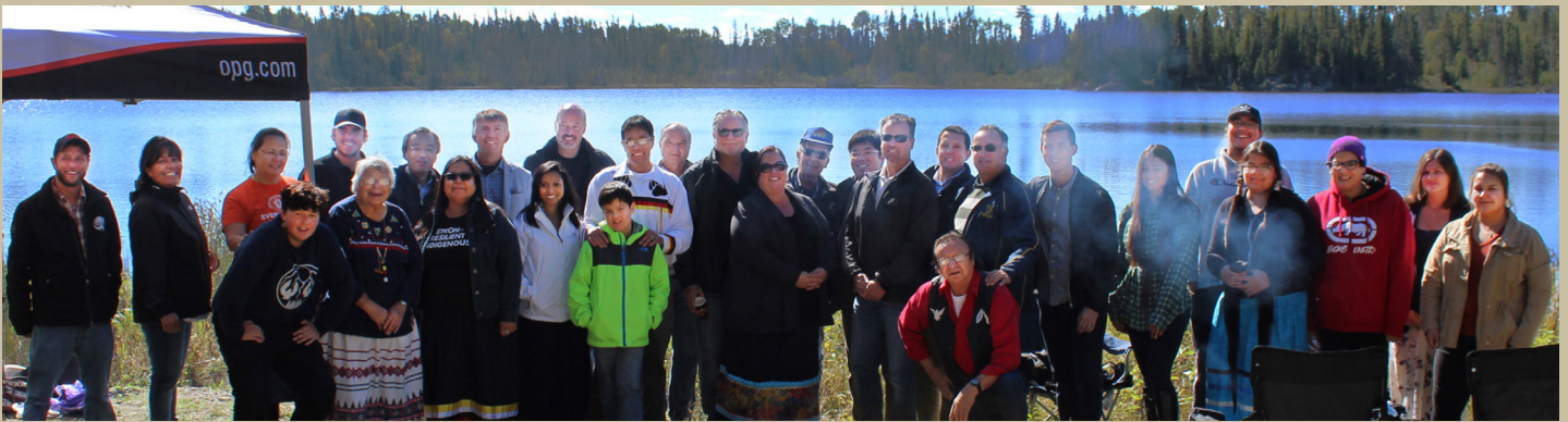
Members of Mattagami First Nation and Flying Post First Nation with representatives from IAMGOLD and Sumitomo Metal Mining Co. at a water ceremony and feast held in September 2019. The water ceremony was in honour of Côté Lake and to acknowledge the sacrifice being made for the Project to proceed.